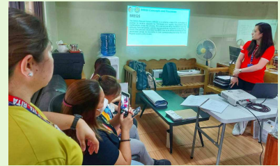
BREQS Installation and Training