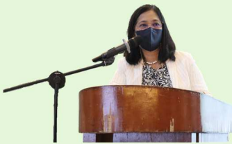
33rd NSM Celebration