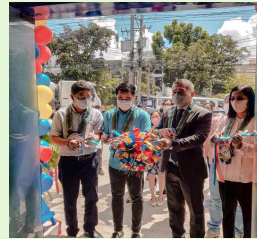
New Serbilis Outlets