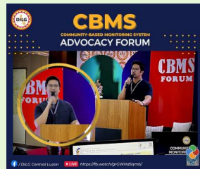
CBMS Advocacy Forum