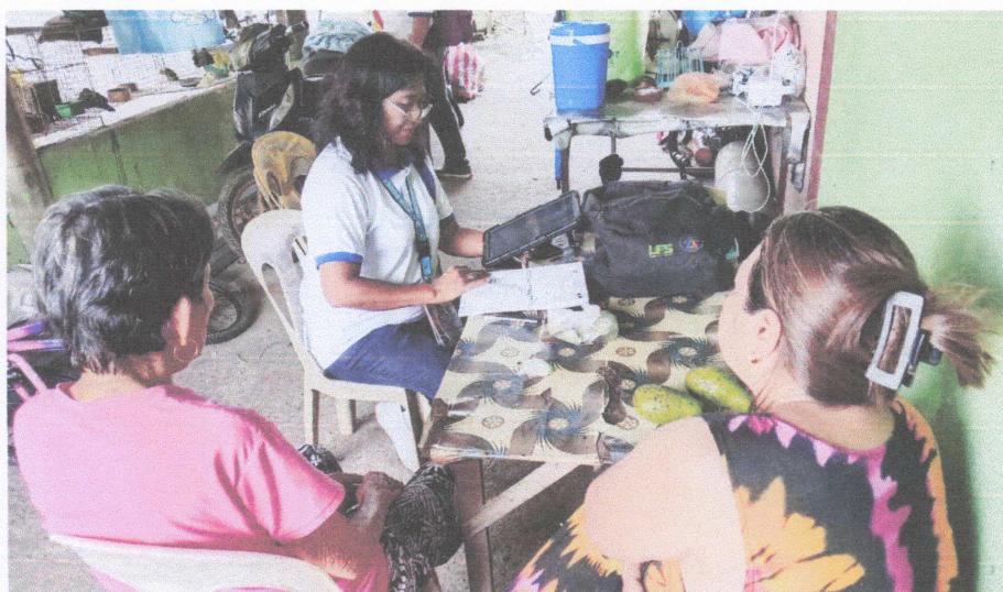
A sample household member answering to the 2025 July Labor Force Survey and 2025 Family Income and Expenditure Survey questions in a sample barangay in Bataan.

The July 2025 Labor Force Survey (LFS) 2025 Family Income and Expenditure Survey (FIES) visit 1 will be conducted on 08 to 31 July. The Labor Force Survey (LFS) is a nationwide survey of households conducted by the Philippine Statistics Authority (PSA) to gather data on the demographic and socio-economic characteristics of the population. Data from the survey provides information on major labor market trends such as labor force participation and unemployment rates, hours worked, past industries and occupations of the currently unemployed persons.