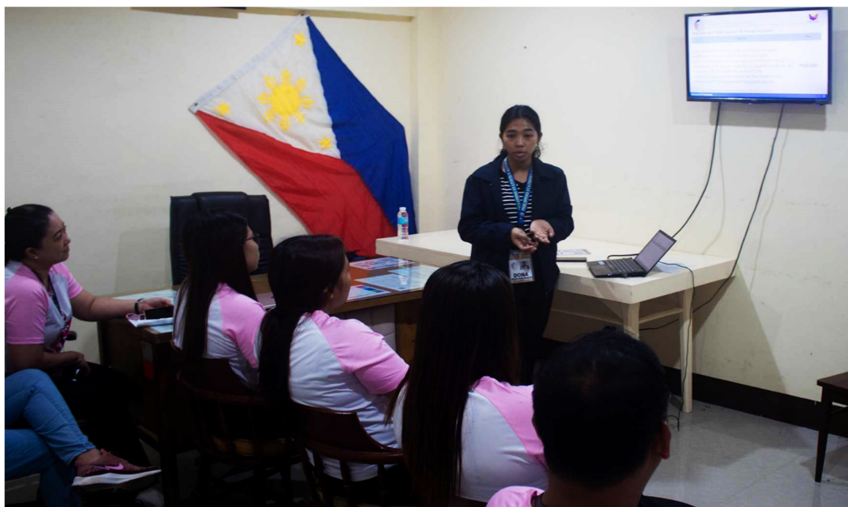
IOI Balasabas discussing the Section 19 of RA 11055 to SMDH employees

The Philippine Statistics Authority (PSA) – Zambales Provincial Statistical Office successfully conducted an informative lecture on the salient features of Republic Act No. 11055 (RA 11055) and the National ID Authentication Services for 16 employees of the San Marcelino District Hospital (SMDH) on July 7, 2025.