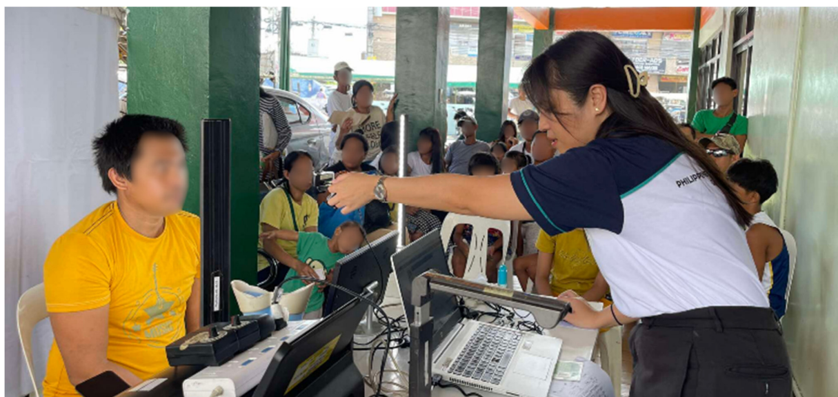
National ID Registration Services in Castillejos, Zambales

The Philippine Statistics Authority (PSA) Zambales Provincial Statistical Office proudly recognizes the invaluable contributions of Local Government Units (LGUs) in the province, following the successful attainment of 250% of its National ID registration target for the second quarter of 2025. This remarkable achievement was made possible through the active collaboration and support of LGUs across Zambales and Olongapo City.