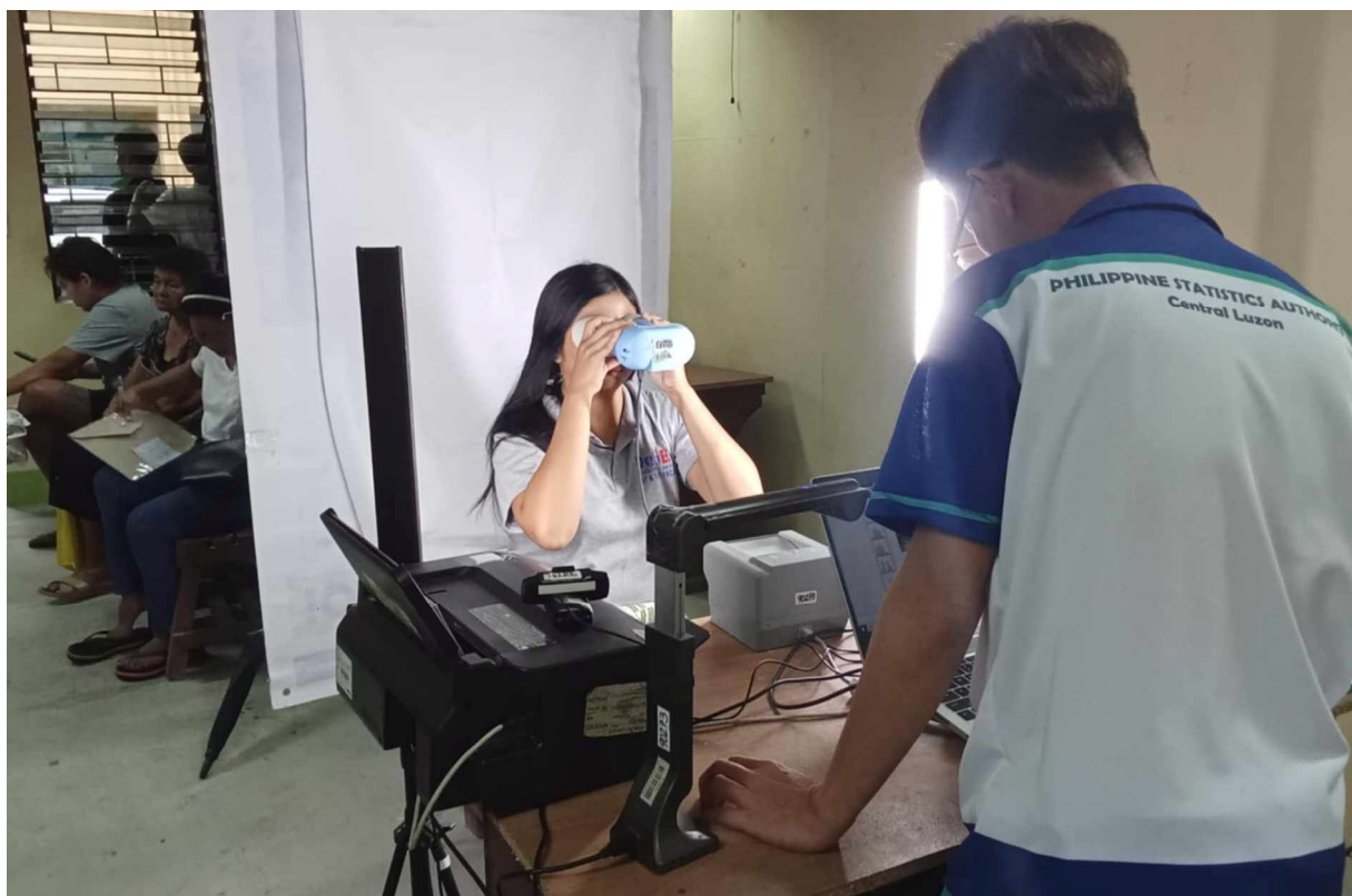
PSA Zambales Registration Kit Operator conducting mobile registration

Zambales, Philippines – The Philippine Statistics Authority (PSA) Zambales has achieved a remarkable milestone for June 2025, registering a total of 2,583 individuals for the National ID, exceeding its monthly target by a staggering 344.40%.