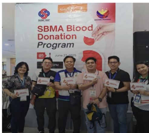
PSA Zambales participated in the Blood Donation Drive held on 27 June 2025 at Ayala Harbor Point Mall.