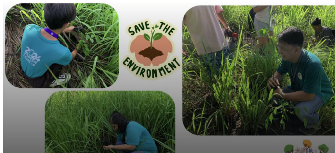
PSA Zambales participated in the Tree Planting Activity held on June 27, 2025, at Sitio Banca-Bancaan, Gordon Heights, Olongapo City.

Zambales, 27 June 2025 – In line with its commitment to environmental stewardship and community development, the Philippine Statistics Authority (PSA) Zambales Provincial Statistical Office (PSO) successfully participated in a Tree Planting Activity held on 27 June 2025 at 6:00 am at Blk. 27 Extension, Waterdam Road, Sitio Banca-bancaan, Gordon Heights, Olongapo City, in collaboration with LGU Olongapo City as part of the Cityhood Anniversary Celebration.