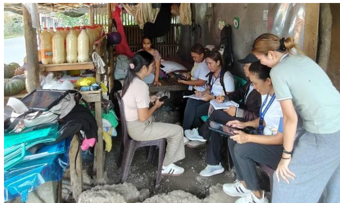
Statistical Researchers during the field interview

Immediately after the training, on 08 July 2025, the field personnel conducted courtesy call with the officials of the sample barangays to seek support and cooperation.