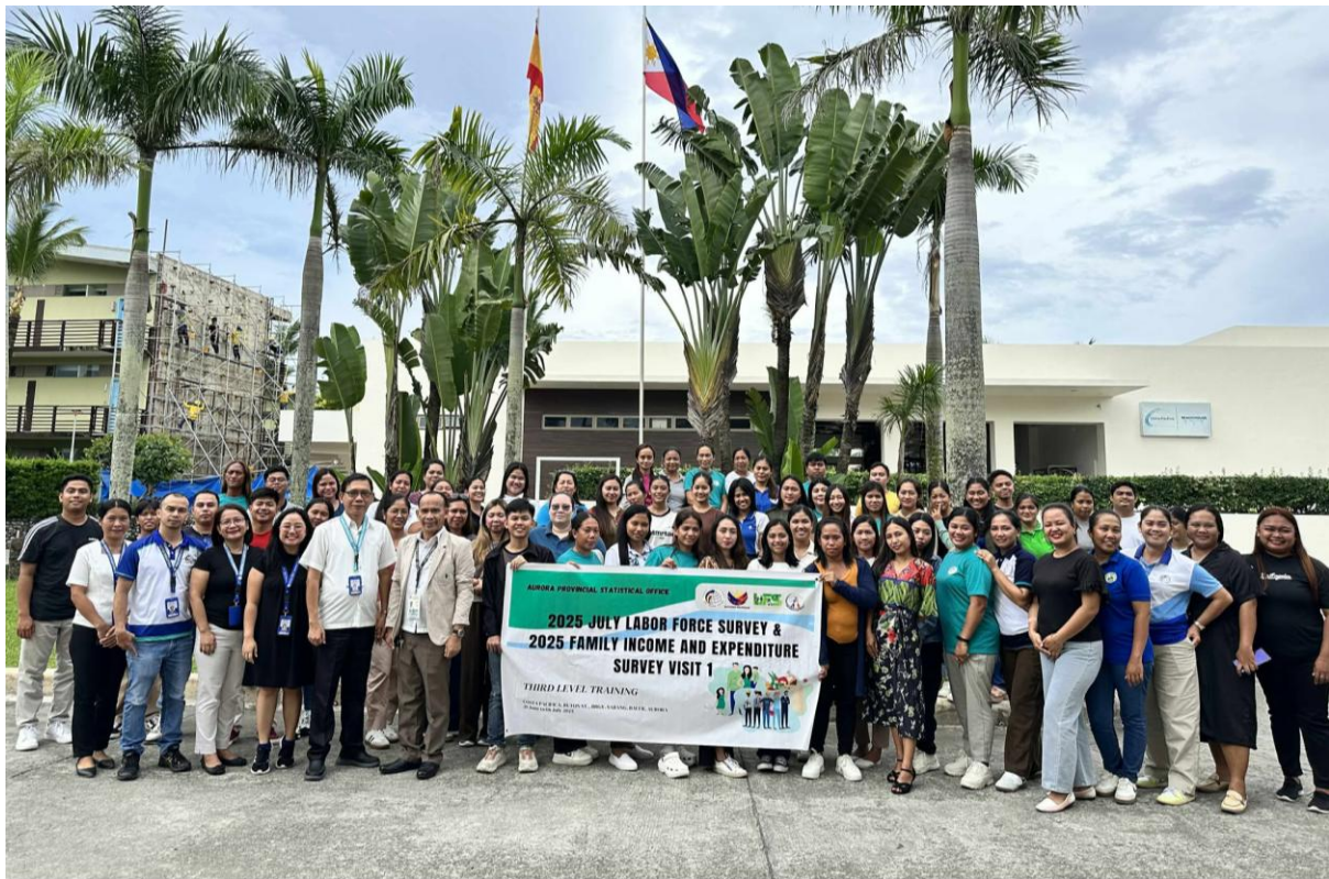
Photo opportunity with the participants of the Third Level Training of July 2025 LFS and 2025 FIES Visit 1

08 July 2025 – BALER, AURORA. The Philippine Statistics Authority (PSA) – Aurora Provincial Statistical Office (PSO) kicked off the conduct of the July 2025 Labor Force Survey (LFS) and 2025 Family Income and Expenditure Survey (FIES) Visit 1 with its Third Level Training held on 30 June 2025 to 06 July 2025 at Costa Pacifica, Brgy. Sabang, Baler, Aurora.