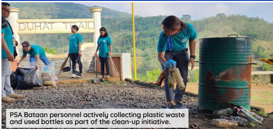
PSA Bataan personnel actively collecting plastic waste and used bottles as part of the clean-up initiative.

The government, through the PSA, remains committed to expanding public awareness by implementing information, education, and communication campaigns that highlight the functionalities and benefits of the National ID.