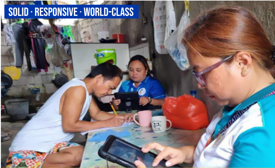
Statistical Researcher and Team Supervisor visiting a sample household to test the literacy of the respondent.