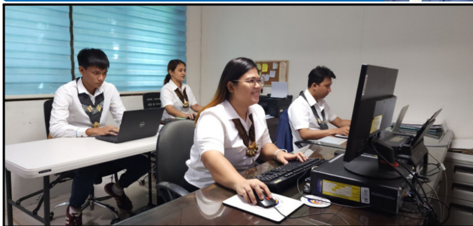
PSA Bataan employees add a touch of traditional accessory to their daily work.