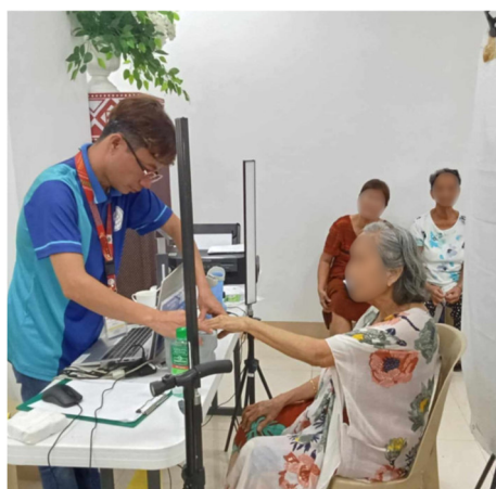
RKO Misa conducts registration to one of social pensioners

IBA, ZAMBALES – June 18, 2025 — The Philippine Statistics Authority (PSA) Zambales, in close partnership with the Local Government Unit (LGU) of Iba, successfully conducted a National ID registration activity at the Iba Municipal Conference Hall on June 18, 2025. The initiative served a total of 82 individuals, with a strong focus on elderly and vulnerable citizens.