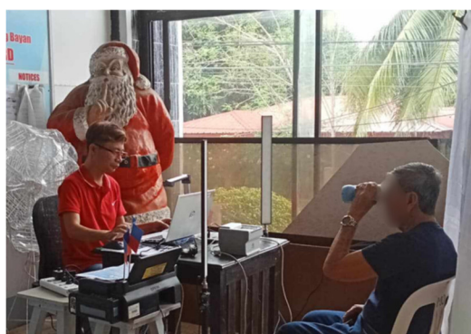
A social pensioner in process for National ID

CANDELARIA, ZAMBALES — June 14, 2025 — In a continued effort to bring essential government services closer to the people, the Philippine Statistics Authority (PSA) Zambales, in partnership with the Local Government Unit (LGU) of Candelaria, successfully conducted a National ID registration drive on June 14, 2025, in Barangay Poblacion.