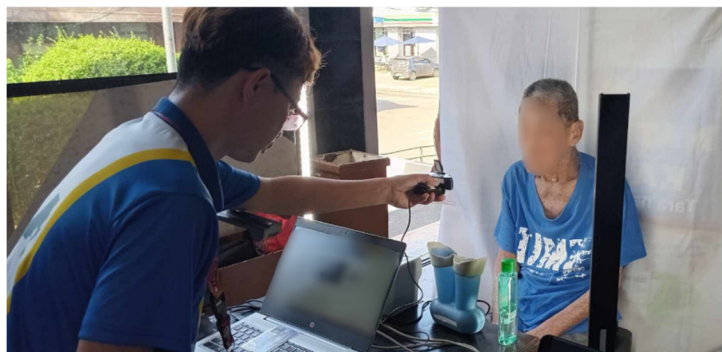
RKO Misa conducting registration to a social pensioner

Candelaria, Zambales – June 13, 2025 — The Philippine Statistics Authority (PSA) Zambales, in partnership with the Local Government Unit (LGU) of Candelaria, successfully conducted a focused National ID registration drive on June 13, 2025. The initiative catered to 23 residents, with special attention given to vulnerable sectors: 15 Social Pensioners and 8 members of the Pantawid Pamilyang Pilipino Program (4Ps).