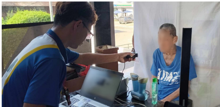
RKO Misa conducting registration to a social pensioner

Candelaria, Zambales – June 13, 2025 — The Philippine Statistics Authority (PSA) Zambales, in partnership with the Local Government Unit (LGU) of Candelaria, successfully conducted a focused National ID registration drive on June 13, 2025. The initiative catered to 23 residents, with special attention given to vulnerable sectors: 15 Social Pensioners and 8 members of the Pantawid Pamilyang Pilipino Program (4Ps).