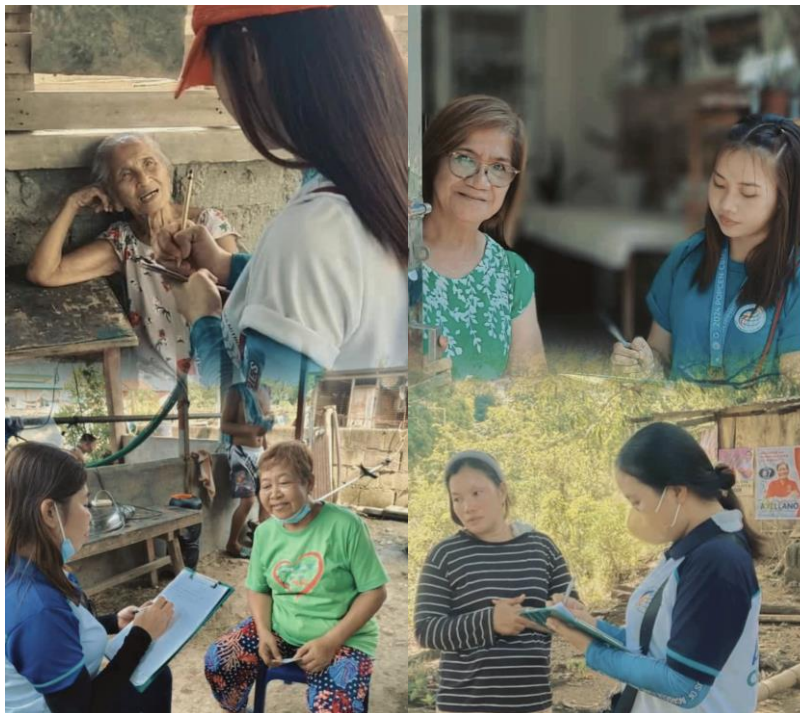
Statistical Researcher of PSA Bulacan during Enumeration

Date of Release: 15 May 2025 Reference No. 2025-PR-0314-07