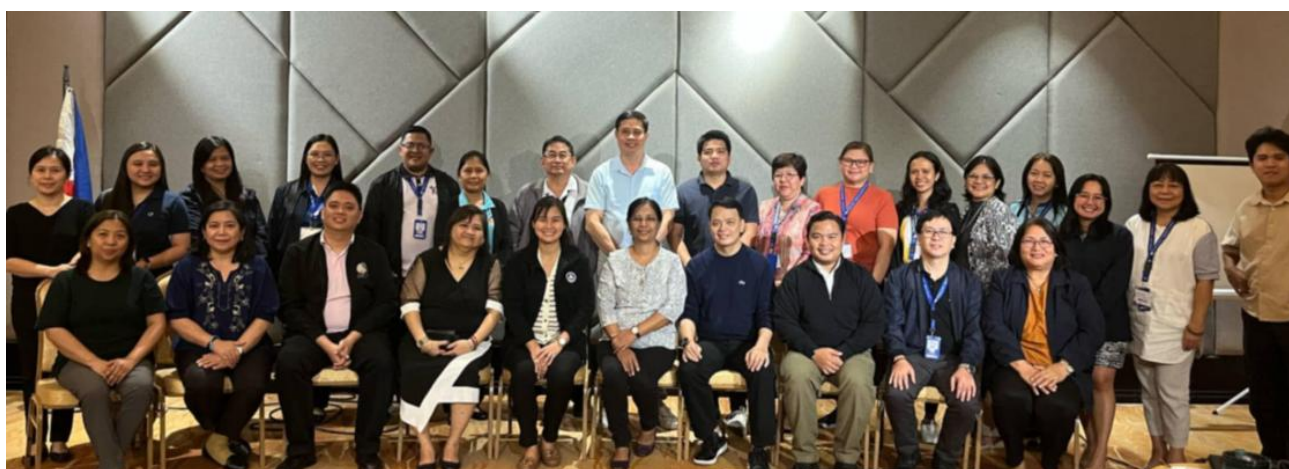
Philippine Statistics Authority Zambales participated in the 4-day training on Public Service Continuity Planning from 22 to 25 of April 2025 at Seorabeol Grand Leisure Hotel, Waterfront Road, Subic Bay Freeport Zone, and Olongapo City.

Olongapo City, Philippines – The Philippine Statistics Authority (PSA) Zambales participated in a four-day training on Public Service Continuity Planning (PSCP) from April 22 to 25, 2025, held at Seorabeol Grand Leisure Hotel, Waterfront Road, Subic Bay Freeport Zone, Olongapo City.