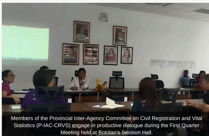
Members of the Provincial Inter-Agency Committee on Civil Registration and Vital Statistics (P-IAC-CRVS) engage in productive dialogue during the First Quarter Meeting held at Botolan's Session Hall.

April 10, 2025 – Botolan, Zambales — The Provincial Interagency Committee on Civil Registration and Vital Statistics (CRVS) held a coordination meeting at the Session Hall of the Municipal Building in Botolan, Zambales. Organized by PSA Zambales, the meeting gathered key stakeholders to review and discuss updates and policies on civil registration.