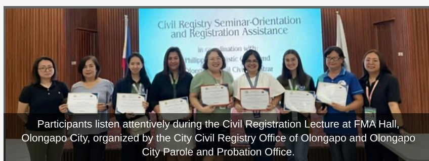
Participants listen attentively during the Civil Registration Lecture at FMA Hall, Olongapo City, organized by the City Civil Registry Office of Olongapo and Olongapo City Parole and Probation Office.

On April 11, 2025, the Philippine Statistics Authority (PSA) Zambales, in collaboration with the City Civil Registry Office of Olongapo and the Olongapo City Parole and Probation Office (OCPPO), participated in a Civil Registry Seminar-Orientation and Registration Assistance held at the FMA Hall in Olongapo City.