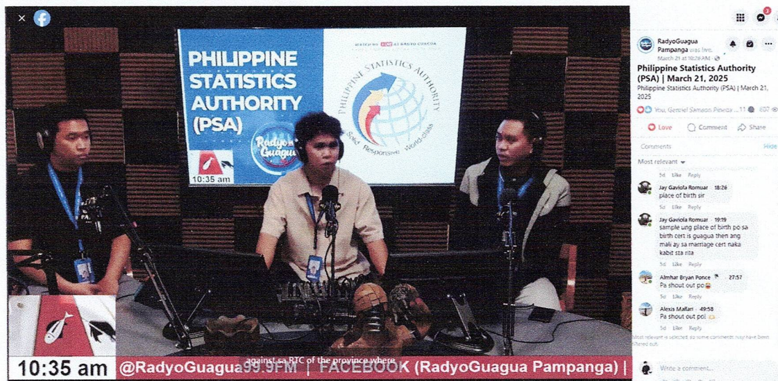
PSA Pampanga Personnel Hosting the Regular Radio Program at Radyo Guagua 99.9 FM