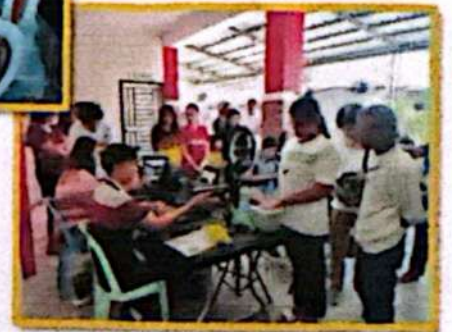
March 11, 2023 Pañaranda, Nueva Ecija