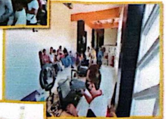
February 17, 2023 Cuyapo, Nueva Ecija