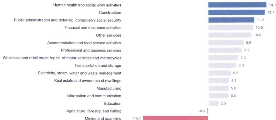
Figure 1. Central Luzon, Growth Rates by Industry: 2023-2024 At Constant 2018 Prices, in Percent

The economy of Central Luzon grew at a faster rate of 6.5 percent in 2024 compared to the 6.1 percent growth in 2023. The top three industries that recorded the fastest growth were the following: human health and social work activities, 14.1 percent; construction, 13.7 percent; and public administration and defense; compulsory social security, 11.2 percent. On the other hand, agriculture, forestry, and fishing, as well as mining and quarrying, posted declines of 0.3 percent and 15.7 percent, respectively. (Figure 1)