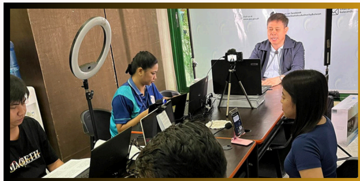
2025 February Inflation Report

Three statistical researchers were assigned to six municipalities in Bulacan, covering 102 sample households. These areas included the City of San Jose del Monte, Balagtas, City of Meycauayan, Pandi, and Santa Maria, selected to ensure a representative sample across the province.