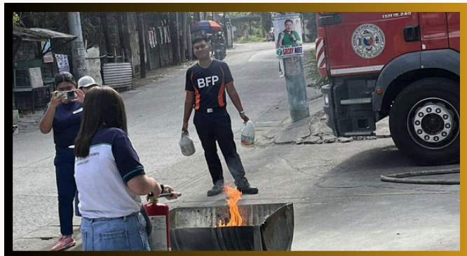
PSA Bulacan staff conducting a fire drill exercise