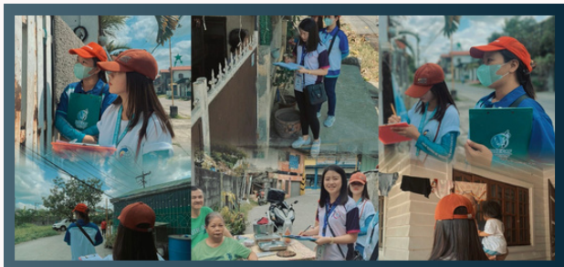
Bulacan Takes Part in PSA's Nationwide Labor Force Survey for 2025 March

The Philippine Statistics Authority (PSA) Bulacan, in collaboration with the Asian Development Bank (ADB), conducted the 2025 March Labor Force Survey (LFS) along with a Jobs and Skills Survey from 8-28 March 2025. The surveys aimed to gather data on the country's employment situation and assess how well the skills of the Philippine workforce matched labor market demands.