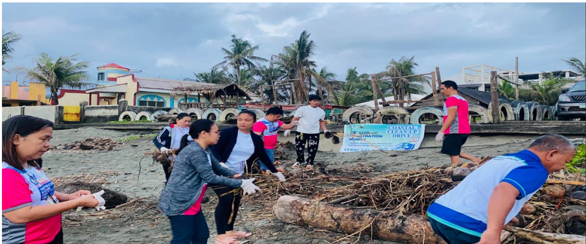
During the Beach Clean-Up Drive Activity at Sabang beach

In addition to improving the local government, PSA Aurora clean-up drive on 28 February 2025, had a significant positive impact on the participants' teamwork and sense of community duty. The favorable results demonstrated how important this program is, for encouraging environmentally friendly behavior and community involvement.