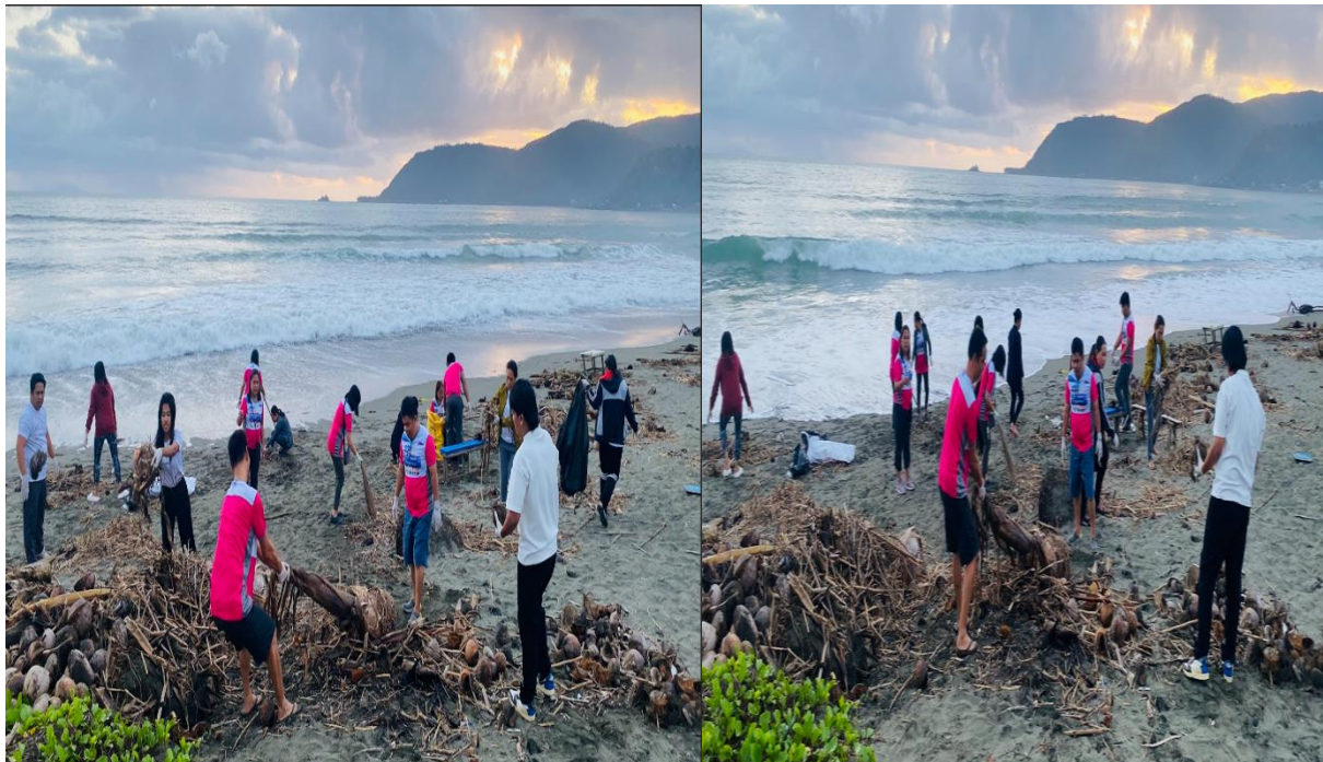
A Photo Opportunity of PSA Personnel during the Beach Clean-Up Drive at Sabang beach

28 February 2025, Baler, Aurora – As part of the celebration of 35 th Civil Registration Month with the theme “Building a Resilient, Agile and Future-Fit, Civil - Registration System” PSA Aurora personnel conducted Clean-Up Drive activity at Sabang beach, Brgy. Sabang, Baler, Aurora. The activity initiated at 6:00 am that involved 27 personnel.