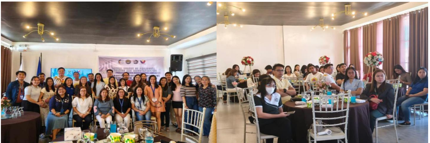
Participants of Annual Survey of the Philippine Business and Industry Data Dissemination Forum and Quarterly Survey of the Philippine Business and Industry Provincial Respondents Forum at Belle's Catering sa Lumang Bahay, Valdefuente, Cabanatuan City, Nueva Ecija on 20 December 2024.

The Provincial Statistical Office of Nueva Ecija successfully conducted the 2022 Annual Survey of Philippine Business and Industry (ASPBI) and 2024 Quarterly Survey of Philippine Business and Industry (QSPBI) Provincial Data Dissemination Forum at Belle's Catering sa Lumang Bahay, Valdefuente, Cabanatuan City on 20 December 2024. This event presented the survey results on the structure, trends, and levels of economic activities in the country for the year 2022. Also, the role of QSPBI Data in Figuring Up the GDP of the Philippines.