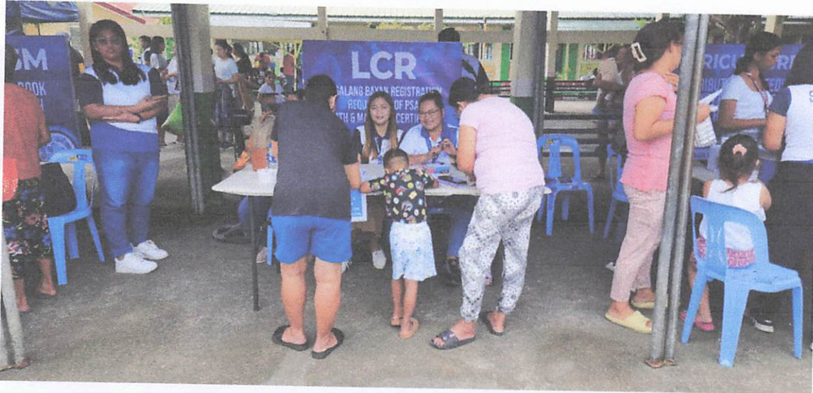
Annex 1. Photos during the mobile registration held at Brgy. East Calaguiman, Samal, Bataan