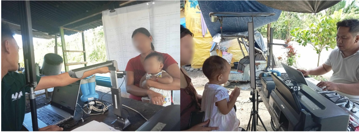
PhilSys team registers 0-4-year-old at Brgy. Bacong, San Luis (Left) and So. Diabuyo Brgy.Ditumabo, San Luis, Aurora (Right).