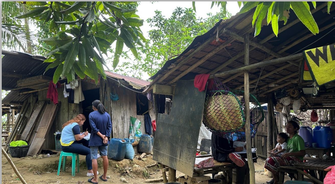
Photo taken during the saturation in Brgy. Dibacong, Casiguran, Aurora.

Reference No. 2025- PRPOPCEN-CBMS – FEB2025-005