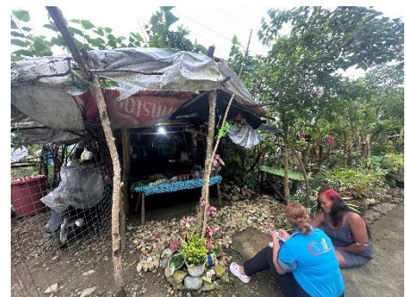
Taken during the saturation in Brgy. Dibacong, Casiguran, Aurora.

The drive succeeded because the Head Census Area Supervisor, all POPCEN-CBMS office-based personnel and several statistical researchers collaborated consistently, guaranteeing every designated barangay had complete coverage efficiently and on time. Provincial census objectives were achieved through an important collective effort as all data processing concluded.