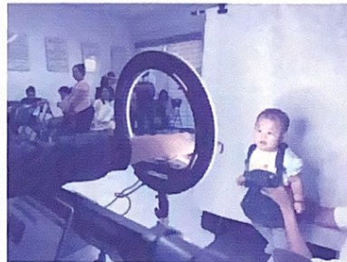
Photo taken during registration of 0-4 years old at the Fixed Registration Center, MMTAN Bldg., Mc Arthur Highway, Tarlac City.

Section 3 of RA 11055 mandates the establishment of a single national identification system for all Filipino citizens and resident aliens, including newborn babies. This ensures that every individual is recognized in official records and can benefit from government programs and services. Registering young children for the National ID offers several advantages. It serves as a reliable form of identification that simplifies access to healthcare, education, and social welfare programs. Having an official record of identity can also streamline various activities, such as school enrollment, obtaining government benefits, and even travel.