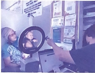
Picture of a child smiling at the camera while capturing his photo.

Date of Release: 30 January 2025 Reference No.: PR-2025-008