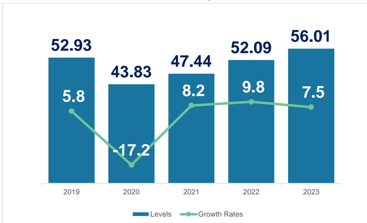
Figure 1. Gross Domestic Product of City of Olongapo In Term of Levels (in Billion PhP) and Growth Rate (in Percent) At Constant 2018 Prices, 2019 to 2023

Including Subic Bay Freeport Zone