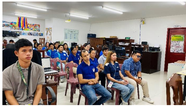
PSA personnel during the program

Attending the opening ceremony of the 35th NSM were the officed-based personnel, project-based personnel, PhilSys Aurora team and OJTs from WUP.