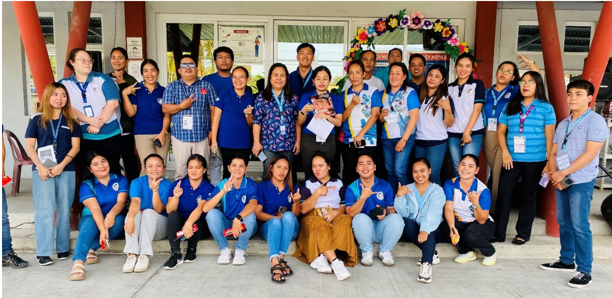
Photo opportunity during the 35 th National Statistics Month

04 October 2024 – Aurora. The Philippine Statistics Authority-Aurora (PSA-Aurora) spearheaded the opening ceremony of the 35th National Statistics Month (NSM) with the theme: “Advancing Data and Statistics through Digital Transformation: A Road to an Empowered Nation” at PSO Aurora.