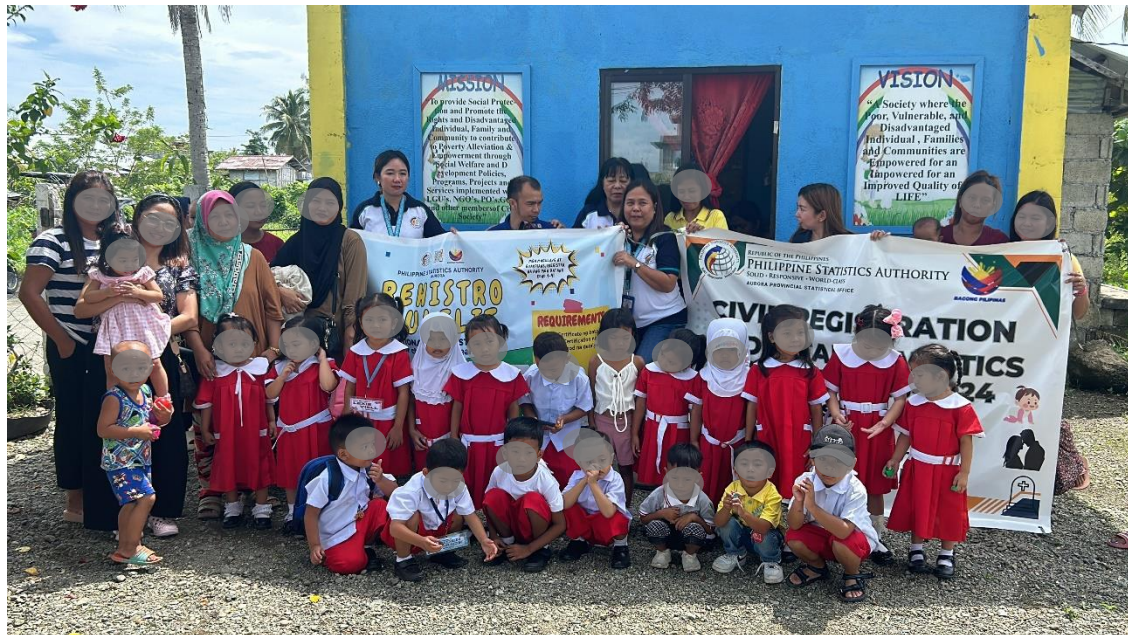
Photo opportunity during the Rehistro Bulilit Campaign including Step 2 Registration

Reference No. 2024-PRPhilSys-August2024-038