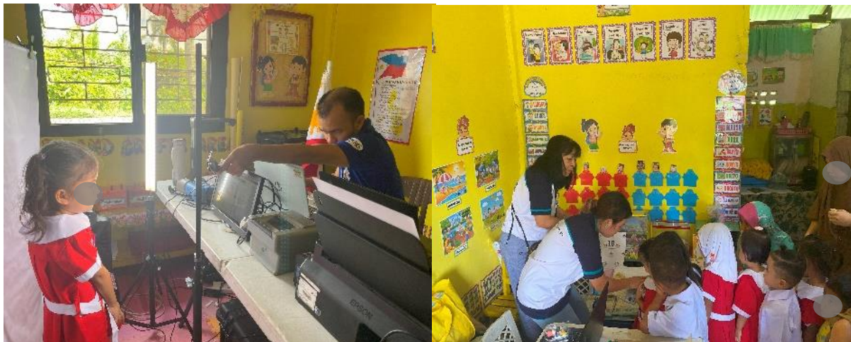
Step 2 Registration and gift-giving during the “Rehistro Bulilit” Launching

The PSA Aurora continues to collaborate with Child Development Centers throughout the province to further the Rehistro Bulilit initiative, with the goal of increasing registration rates for children.