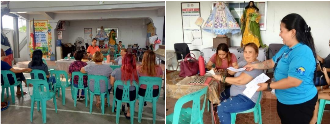
PSA Zambales and LCRO San Narciso team up for the continued implementation of BRAP in Zambales.