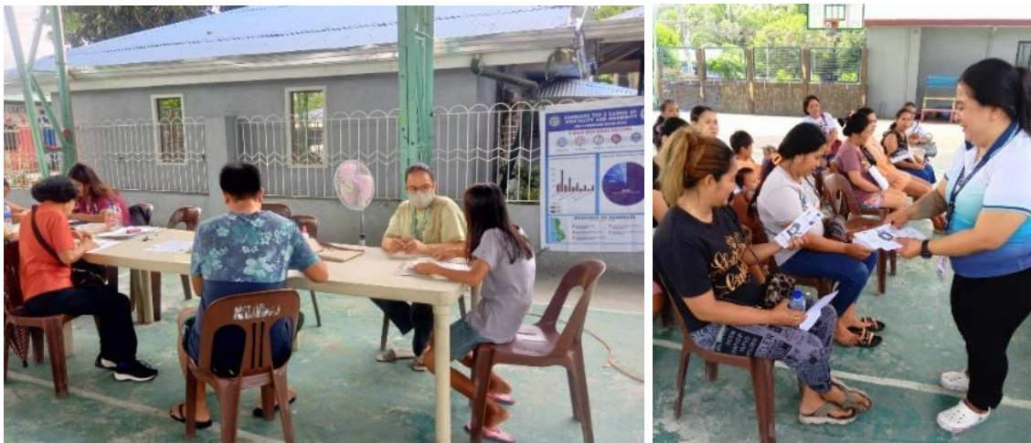
PSA Zambales and LCRO San Narciso team up for the continued implementation of BRAP in Zambales.