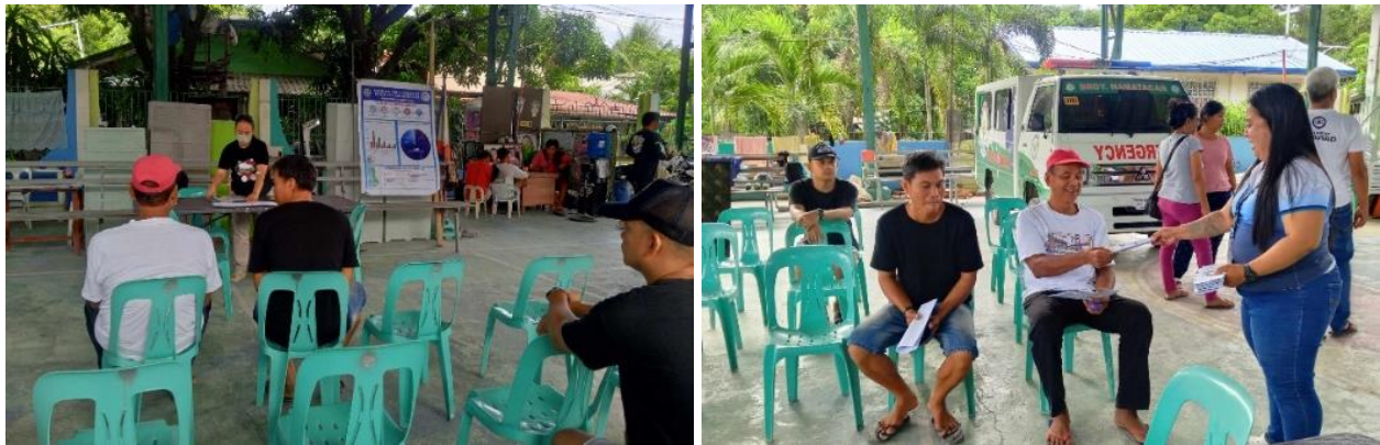
PSA Zambales and LCRO San Narciso team up for the continued implementation of BRAP in Zambales.