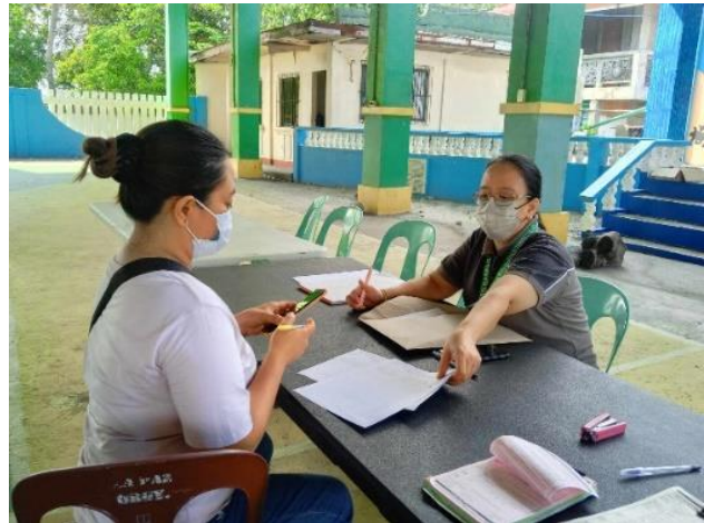
PSA Zambales and LCRO San Narciso team up for the continued implementation of BRAP in Zambales.

The activity went beyond not only processing birth registrations but also conducted informative lecture on civil registration. Additionally, informative materials and an infographics exhibit were presented, providing residents with a better understanding of their rights and responsibilities regarding civil registration.