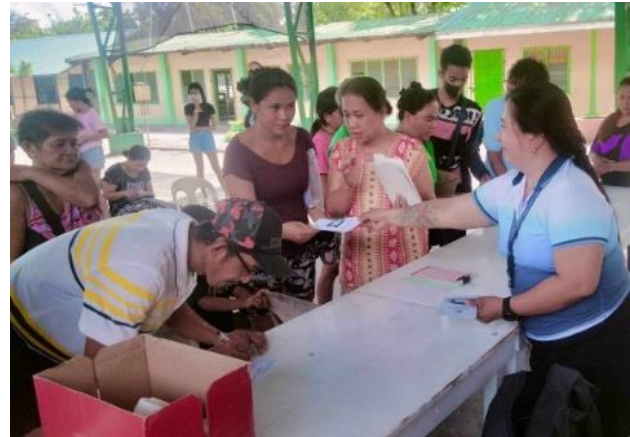
PSA Zambales and LCRO Castillejos team up for the continued implementation of BRAP in Zambales.

The activity went beyond not only processing birth registrations but also conducted informative lecture on civil registration. Additionally, informative materials and an infographics exhibit were presented, providing residents with a better understanding of their rights and responsibilities regarding civil registration.