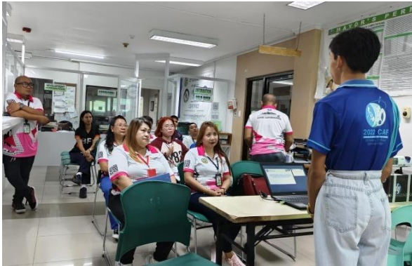
COSW-PPA AS Costillas during conducting training of PSGC

The primary goal of the training is to further expand and enhance collaboration and data sharing between LGU and PSA in order to create a comprehensive picture of the nation's socioeconomic progress, which will enable better decision-making and more effective government service delivery. Thus, to improve the LGU's proficiency with PSIC and PSGC while also guaranteeing consistency and comparability of the data generated, which will be utilized to create aggregated data that local planners and policy makers may utilize.