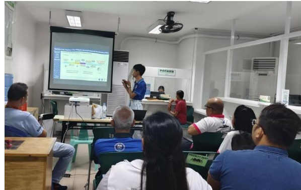
COSW-PPA AS Costillas during conducting training of PSIC