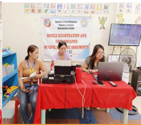
MCRO Personnel registering day care pupils