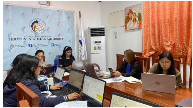
Captured while participants are doing their activity

The training focused on equipping attendees with advanced techniques in MS Excel, crucial for their roles in data management and statistical analysis. Through practical sessions and theoretical insights, participants gained valuable knowledge that promises to enhance their productivity and proficiency in managing statistical data.