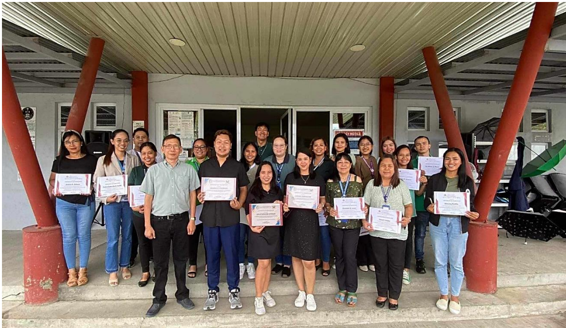
During the Closing Ceremony of the training – 26 June 2024.

26 June 2024 – Baler, Aurora: The Philippine Statistics Authority – Aurora, in collaboration with Bulacan State University (BuSU), successfully conducted a three-day training program on Data Management and Visualization using Microsoft (MS) Excel Application. Held at the J.S. Center in Brgy. Pingit, Baler Aurora, the event aimed to enhance the skills of local government and Provincial Statistical Office (PSO) personnel in handling statistical data effectively.