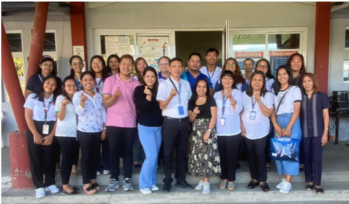
Participants photo opportunity at the beginning of the training

This initiative underscores the commitment of the Philippine Statistics Authority – Aurora and Bulacan State University to foster continuous learning and capacity building among local government units. By empowering personnel with essential skills in MS Excel, the organizations aim to facilitate more efficient and accurate data processing, ultimately benefiting the communities they serve.