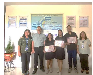
Giving of token and certificate to BuSU Team