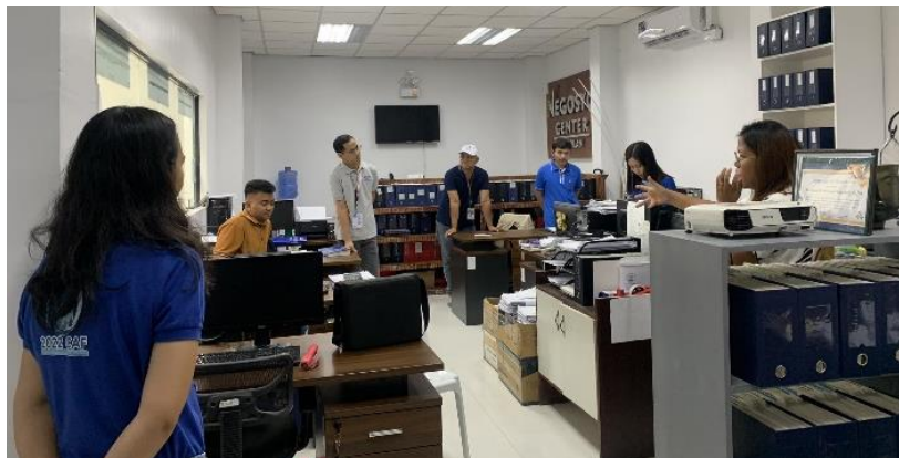
SrSS Mawili conducting training on PSIC and PSGC

The primary goal of the training is to further expand and enhance collaboration and data sharing between LGU and PSA in order to create a comprehensive picture of the nation's socioeconomic progress, which will enable better decision-making and more effective government service delivery. Thus, to improve the LGU's proficiency with PSIC and PSGC while also guaranteeing consistency and comparability of the data generated, which will be utilized to create aggregated data that local planners and policy makers may utilize.