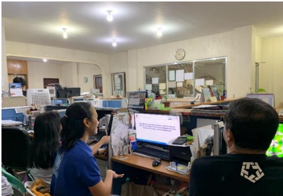
SrSS Mawili conducting training on PSIC

The primary goal of the training is to further expand and enhance collaboration and data sharing between LGU and PSA in order to create a comprehensive picture of the nation's socioeconomic progress, which will enable better decision-making and more effective government service delivery. Thus, to improve the LGU's proficiency with PSIC and PSGC while also guaranteeing consistency and comparability of the data generated, which will be utilized to create aggregated data that local planners and policy makers may utilize.