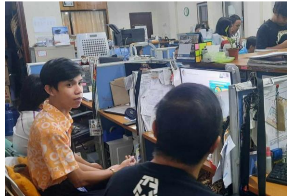
COSW-AS Costillas conducting training on PSGC