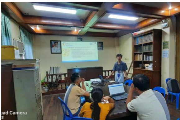
COSW-AS Costillas conducting training on PSIC and PSGC

The primary goal of the training is to further expand and enhance collaboration and data sharing between LGU and PSA in order to create a comprehensive picture of the nation's socioeconomic progress, which will enable better decision-making and more effective government service delivery. Thus, to improve the LGU's proficiency with PSIC and PSGC while also guaranteeing consistency and comparability of the data generated, which will be utilized to create aggregated data that local planners and policy makers may utilize.